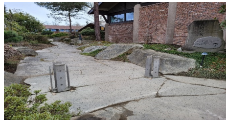
The North Entrance and South Entrances

Are you starting to feel our excitement NOW? Stay tuned for our next report!